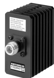
K 62 26 40 1